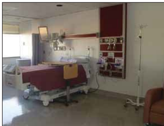
Private Intensive Care Rooms

The new heart center, which will open in the expansion wing, has an open-heart surgery suite for bypass surgery and other heart procedures. All the beds are capable of cardiac monitoring from the intensive care unit. The expansion also added operating suites, digital X-ray imaging system and two cardiac catheterization labs. The State of California Health Department is expected to grant its licensing in February, and the newest wing will be up and running.