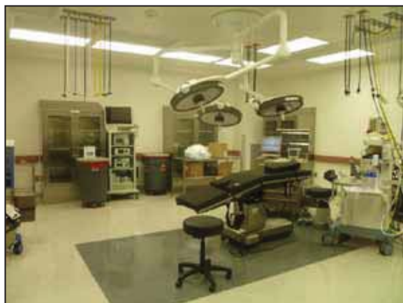
Open-heart Surgery Suite