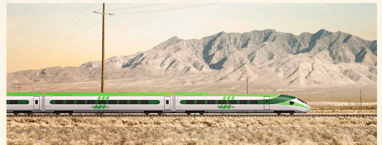
Continued on page 2