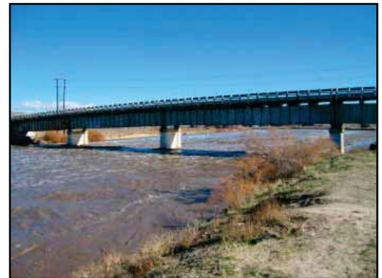
The Mojave River is the lifeblood of the desert.