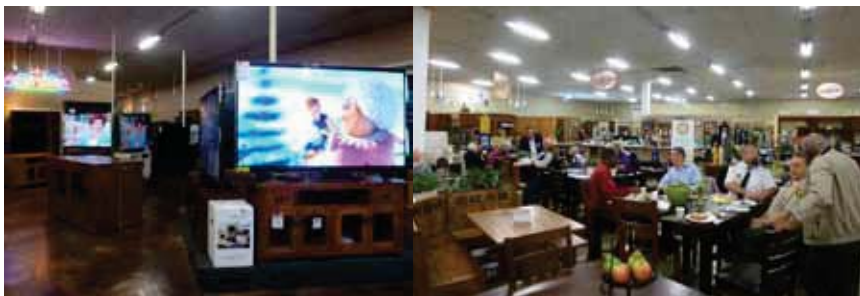
Above: Midway Theater and Dining Rooms