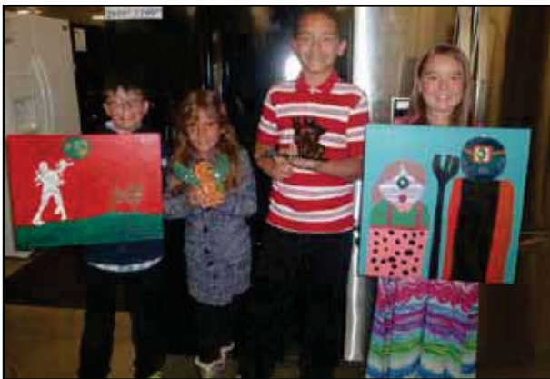
Students from Riverside Prep Elementary School showcase their art projects made possible by Mini-Grants.