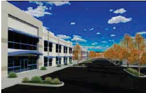
Medical Office Building