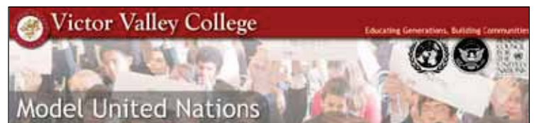
Below: VVC Model U.N. Team of 2013 in New York