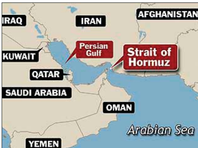
The importance of the Strait of Hormuz as a strategic world waterway

The subject of American interests in the Middle East is a complicated one. Donovan describes oil independence as a "revolution", with many long-term consequences. He feels there is lots to be optimistic about in the decades to come, and foreign oil independence is one of those things.