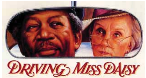
Morgan Freeman and Jessica Tandy - 1989