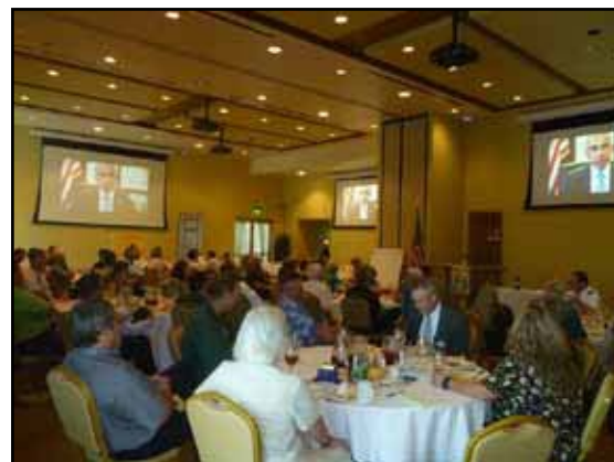
Full house at Rotary this week for the District Attorney's presentation.