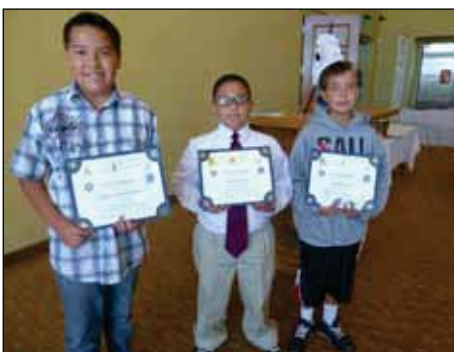
Endeavour School of Exploration