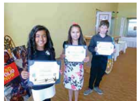
Green Tree East Elementary School