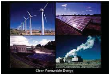
Clean Renewable Energy