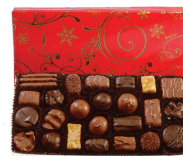
Assorted Chocolates Milk and dark decadence. Delivered in seasonal wrap. 1 lb $20.50 #318 2 lb $41.00 #319