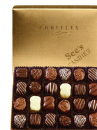
Truffles Wonderfully decadent and rich. 1 lb $23.20 #902