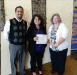
Park View Elementary