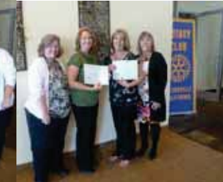
West Palms Conservatory