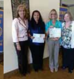
Sixth Street Prep