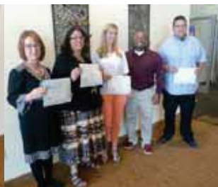
Riverside Prep Middle School