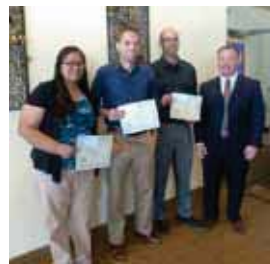
Academy of Careers & Exploration