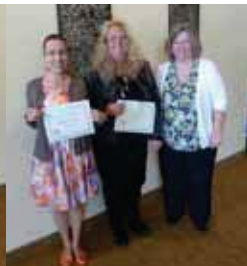
Discovery School of The Arts