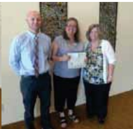
Challenger School of Sports & Fitness