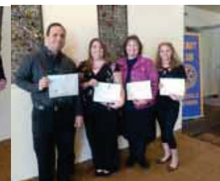
Hook Junior High School

The Rotary Club of Victorville's 2013-2014 Teachers' Mini-Grant Program awards teachers who support a most creative and innovative approach to enhancing student interest in the acquisition of knowledge.