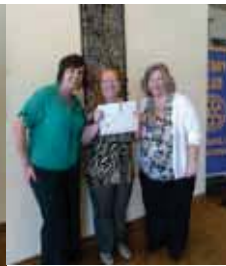
Green Tree East Elementary