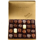
Truffles Wonderfully decadent and rich. 1 lb $23.20 #902