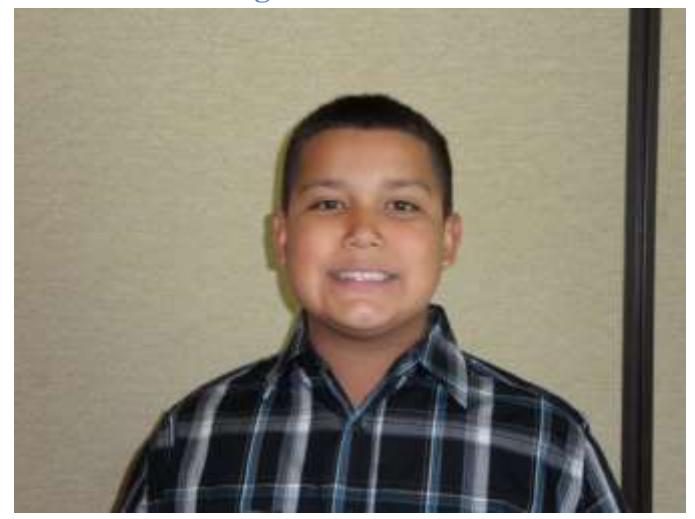
S.T.A.R. student from Mountain View Montessori Charter School received a certificate and a $25 gift certificate to Target.