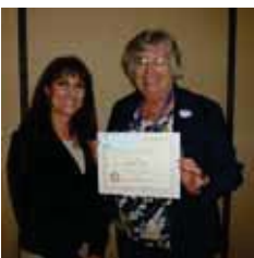
Victor Valley Christian