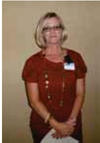
6th St. Prep