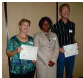
Village Elem. & West Palms Conservatory