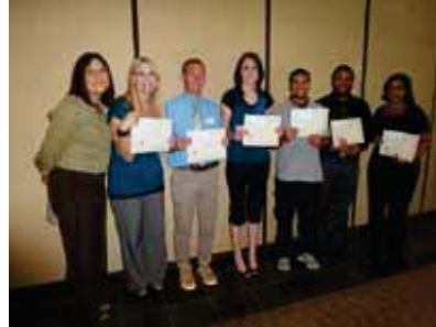
Riverside Prep Elem.