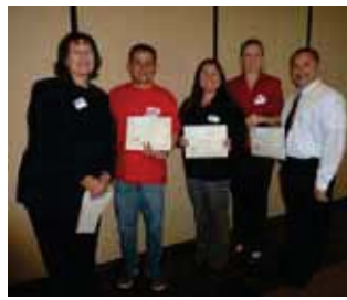
Hook Jr. High