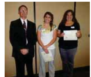
Riverside Prep Elem.