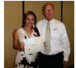
Victor Valley H.S.